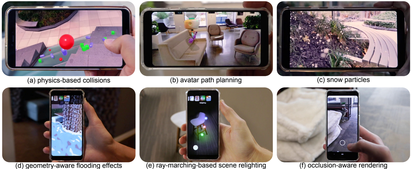
Figure 1. Real-time interactive components enabled by DepthLab: (a) virtual objects colliding with real stairs; (b) virtual avatar path planning and geometry-aware shadows; (c) AR snow effect; (d) virtual flooding effects bounded by physical walls; (e) scene relighting with three virtual point lights; (f) occlusion-aware rendering of a virtual cat behind the real bed. Please refer to the main paper [1] and the accompanying video for more results.